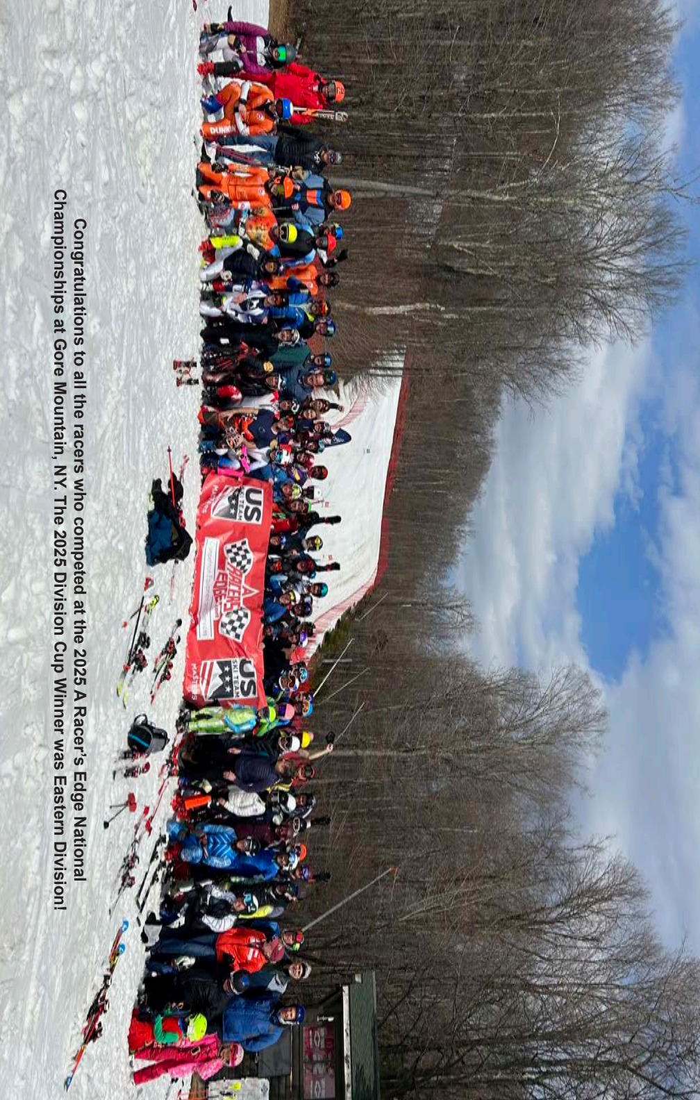
Congratulations to all the racers who competed at the 2025 A Racer's Edge National Championships at Gore Mountain, NY. The 2025 Division Cup Winner was Eastern Division!