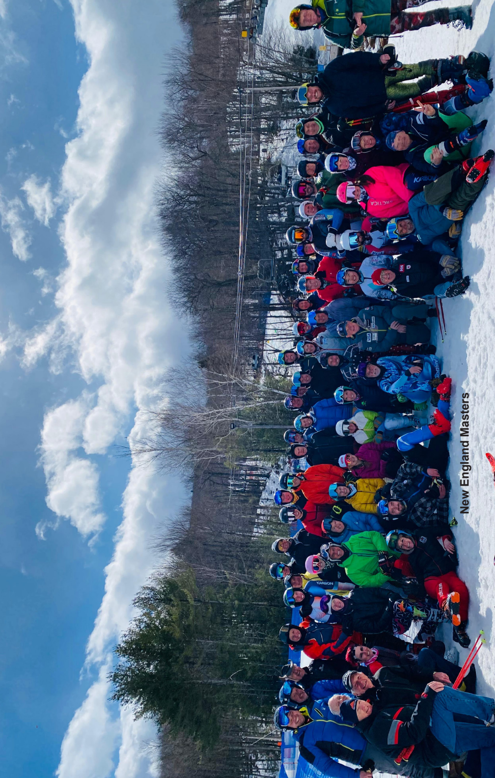
New England Masters