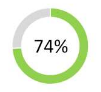
Figure 4: FIS' scores on the four SGO dimensions